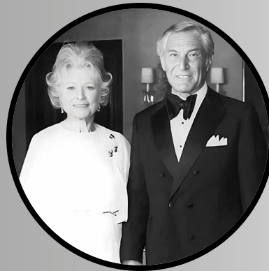
THE ROSALINDE AND ARTHUR GILBERT FOUNDATION